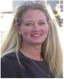
Faith Stamps Governor-elect